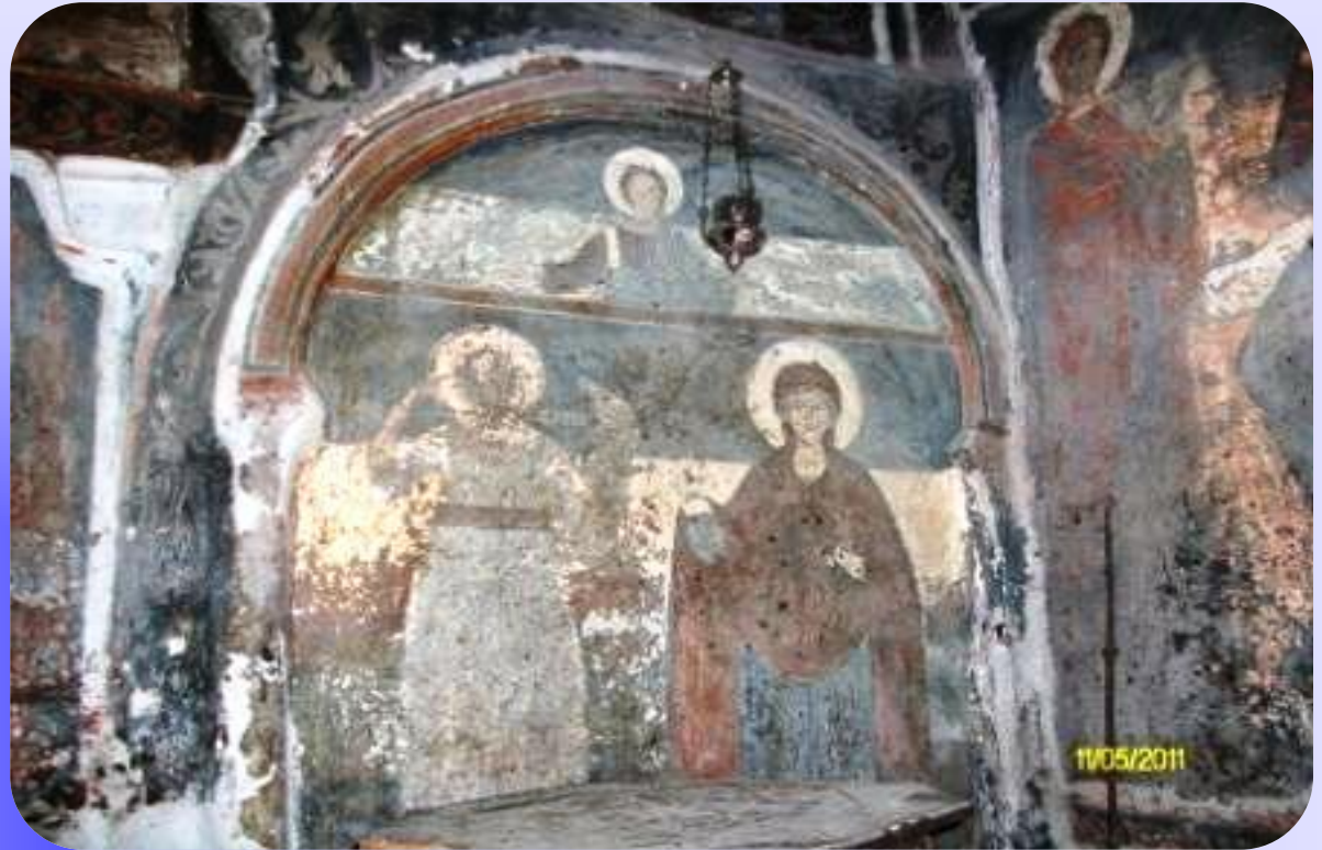
Kirikos and Ioulitta, the patron saints